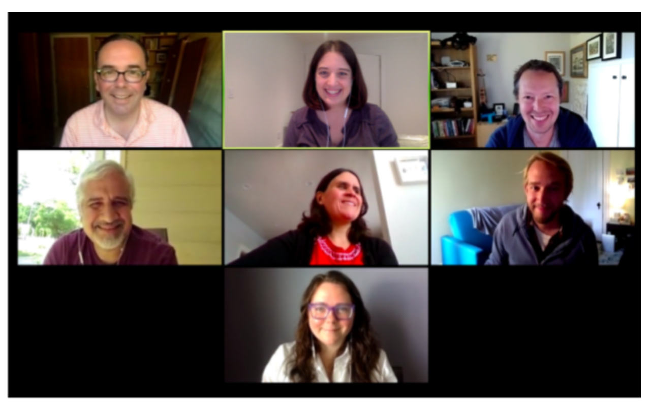
Our staff - pictured here in our Zoom All Staff in July - played a big role in our success this year

Another highlight of last fiscal year is the performance improvement of our global Programs & Events Dashboard. This software has been enabling thousands of Wikimedia program leaders from all over the world to track the results of their programmatic activities. When the continuously increasing amount of usage brought our software to its limits, we worked with an external performance consultant on migrating the software to a distributed system. As a result of this work, the Programs & Events Dashboard is now running on a coordinated set of servers that can easily be scaled up to handle higher loads. This important step will allow even more Wikimedia program leaders around the world to measure the impact of their initiative for years to come. Maintenance and improvement of this critical piece of infrastructure is one of Wiki Education's key contributions to the global Wikimedia Movement.