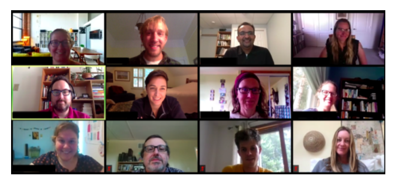
Wiki Education's Scholars & Scientists courses were on Zoom even pre-pandemic.